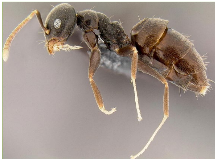
White-footed ant worker, Technomyrmex difficilis .

If you suspect that you have found ants that are exotic contact your local biosecurity organisation or the Exotic Plant Hotline on 1800 084 881.