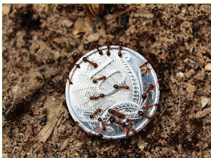
Red imported fire ants of various sizes on a 10 cent coin.