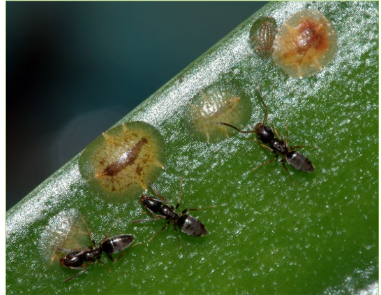
Odorous house ant, Tapinoma sessile , collecting tending scale insects.

EIAs are important because they are area pests that can be transported in container plants. In the event that an EIA is detected and a quarantine put in place, businesses will need to meet certain requirements to continue trading. Such requirements could include pesticide applications of plants, pots and growing areas, keeping records and perhaps growing requirements.