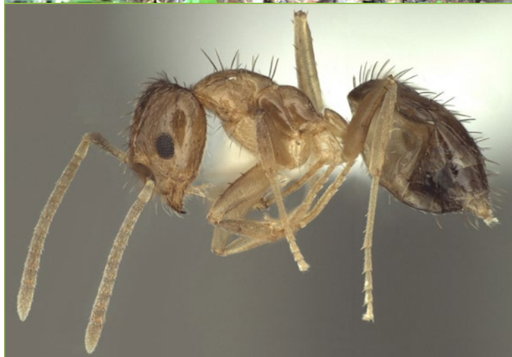
Tawny crazy ant ( Nylanderia fulva) nest underneath a piece of wood (above –), worker tawny crazy ant (below –).