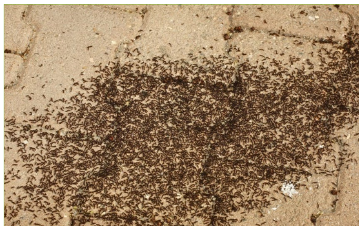
Pavement ants, Tetramorium caespitum

Despite these rather broad biological characters that are shared by many ant species, there are other aspects of their biology that are quite variable. Most notably their daily activity and nesting habits. Furthermore, sometimes different colonies of the same species have important behavioural differences, e.g. some colonies may or may not produce winged queens or have one or multiple queens per colony. These biological characteristics can have important implications in how biosecurity organisations eradicate the ants in question.