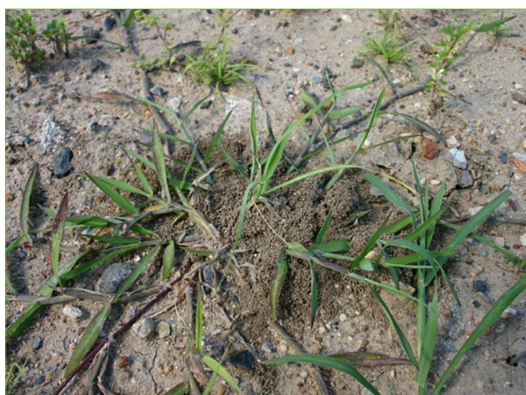
RIFA nest amongst weeds.