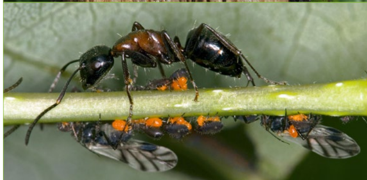
Honeycomb damage caused within a tree by Camponotus sp., carpenter ants (above – photo by Steven Katovich, USDA Forest Service, Bugwood.org). Carpenter ants tending aphids (below – photo by David Cappaert, Bugwood.org).