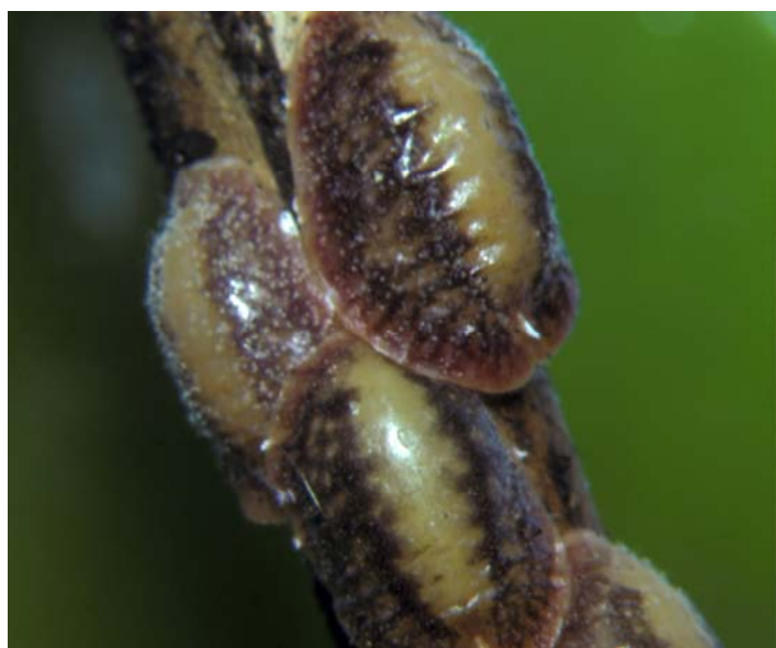
Fig. 2. Pink wax scale on Schoenoplectus , lake club rush (top). Soft wax scale, Ceoplastes sp. (middle - John. A. Weidhass, Virginia Polytechnic Institute and State University, Bugwood.org); cottony camellia scale (bottom - United States National Collection of Scale Insects Photographs, Bugwood.org).