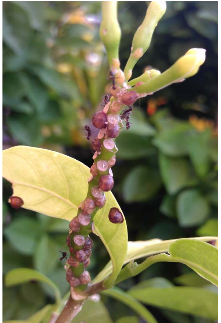
Fig. 1. Coccid (soft) scale insects attended by ants.

All scale insects have a similar basic biology, though exceptions occur. Scale insects are sack-like and often do not have functional legs. The 'scale' refers to a substance secreted over the back of the insect. In most cases, adult females are sedentary and do not move. Most species lay eggs underneath their body, though some lay live young. Some species are parthenogenetic, meaning that they can