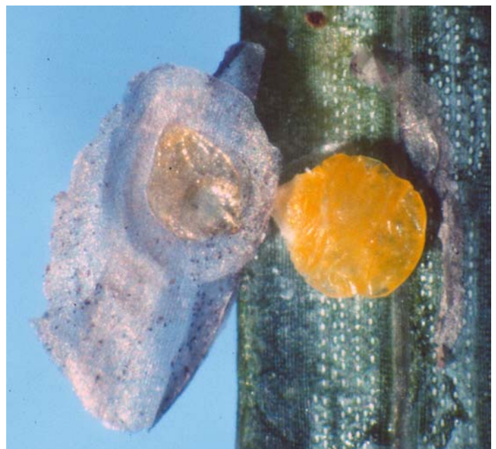
Fig. 3. Hard scale with cover removed showing body beneath.

Remove plants with heavy infestations, taking care to reduce spread of scale insects while doing so. If infestations are limited to a particular branch and it can be pruned, remove this plant material and monitor closely to ensure the rest of the plant is clean. Also remove crop debris regularly and disinfest the growing area to reduce reinfestation of pests into the crop.