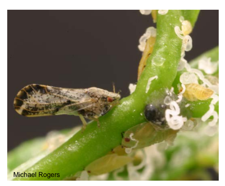
Fig. 2. Adult and nymphal ACP feeding on citrus.

Movement of psyllid-infested plant material, including fruit and foliage, is the most common method of long distance spread of D. citri ; it is a well established hitchhiker (Halbert et al. 2010) and can survive up to 10 days on detached stems and up to 20-30 days on detached stems with fruit (Hall & McCollum 2011). Ornamentals and food plants such as orange jasmine ( M. exotica ) and curry leaf ( Bergera koenigii ), respectively, have also been known to spread psyllids. Tropical storms and cyclones may lead to long distance spread of D. citri , as could illegal importation of host plants into Australia, including leaves such as kaffir lime, leaves or curry ( B. koenigii ) for cooking