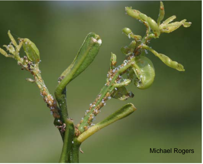
Fig. 3. Damage caused by large numbers of ACP (above) and black-sooty mould and waxy tubules on citrus leaves.