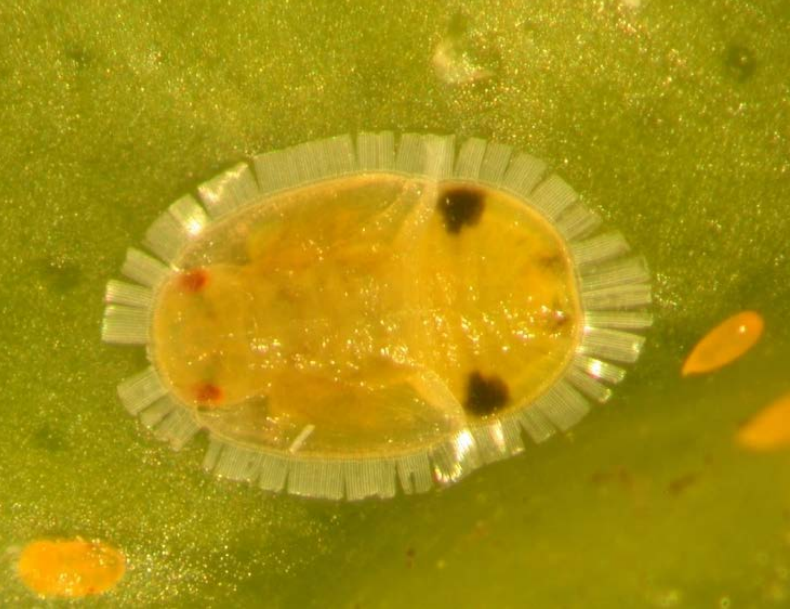
Fig. 4. Nymphal Trioza erytreae on citrus.

although they are occasionally laid on tender young thorns, flower buds or young lemon fruit (van den Berg 1990). Eggs hatch after 5-17 days, depending on temperature (van den Berg 1990). First instar nymphs feed on the underside of the leaves or soft stems where they begin to form open galls. The feeding of a large number of nymphs causes curling of the leaves, distortion of shoots and even cessation of growth. The nymphs moult five