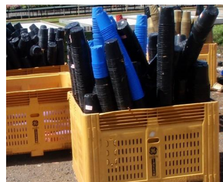
Figure 4: Containers being prepared for steaming or recycling.

Reusing an item in its original form for the same purpose more than once will help to reduce costs and resource use. Simply washing or sterilising reusable items can be considerably cheaper when the combined purchase and disposal costs are considered. One large production nursery has embraced the reuse principle by installing a steaming system to sterilise growing containers and production equipment. A second hand diesel steam generator and cargo container was installed with a new control unit at a cost of $39,400. The system is run overnight for 12 hours to ensure all items are sterilised. The system has the potential to save more than $30,000 in growing containers, provide for a continuous supply of clean production