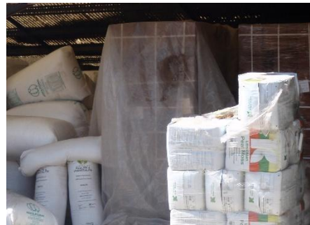
Figure 3: An increase in plastic packaging on inputs increasing disposal costs.

Avoiding or reducing waste is a better option than diverting waste as the initial costs are not incurred and the resources are not used. This involves reviewing production processes and purchasing practices to increase resource use efficiency and reduce waste generation. For example, a change in suppliers or an increase in production may have increased the volume of packaging needing disposal. In this case purchasing products in bulk to reduce the volume of packaging or reviewing the production process can improved resource use efficiency.