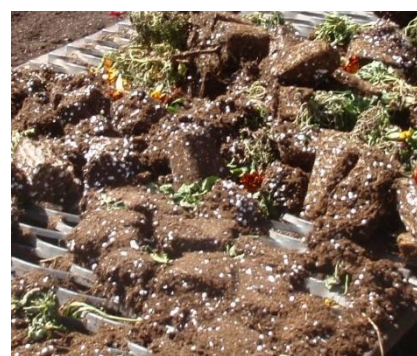
Figure 1: Rejected plants and greenwaste dumped in onsite landfill

Although there is a large quantity of greenwaste generated, only 21 per cent is sent to a commercial processing facility for mulching or composting. Fifteen per cent is still being sent to landfill via a general waste service and the remaining 64 per cent is dumped or composted onsite but no longer used for production. Eighty two per cent of survey respondents stated they recycle cardboard and paper, and sixty four per cent recycle plastic growing containers but less than 52 per cent recycle other plastics (chemical and fertiliser drums, packaging, pallet wrap and strapping). Several survey respondents stated they have halved their general waste disposal costs by recycling as many materials as possible. Several respondents expressed frustration associated with not being able to recycle certain wastes and the increasing quantity of plastic packaging that goes to general waste. A large proportion of recyclable materials is still being disposed as general waste, primarily due to the limited recycling infrastructure and services outside of city centres.