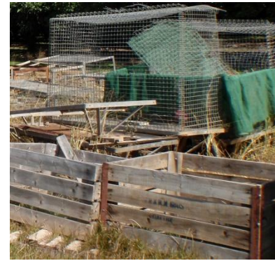
Figure 5: Disused or damaged equipment wanting to be recycled.

Recycling involves the collecting and processing of an item to recover the raw material to remake the original item or a new item. For example, an increased volume of clean packaging could warrant separation from general waste for recycling. Collecting a sufficient quantity of clean packaging such as cardboard or plastic to increase the collection value can reduce disposal costs. If a large quantity is generated some collection companies may provide a compactor to assist in onsite collection. An added advantage of separating these materials from general waste could be to reduce your general waste disposal requirements allowing for a cheaper service.